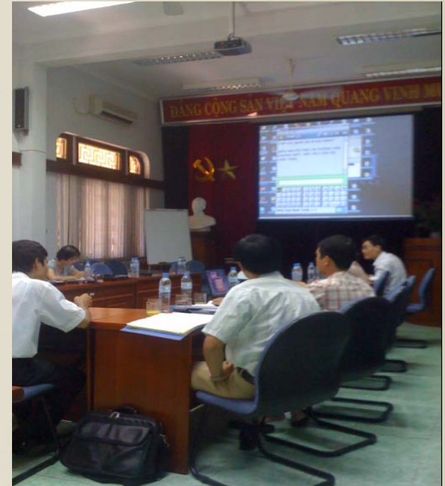
Hanoi Medical University