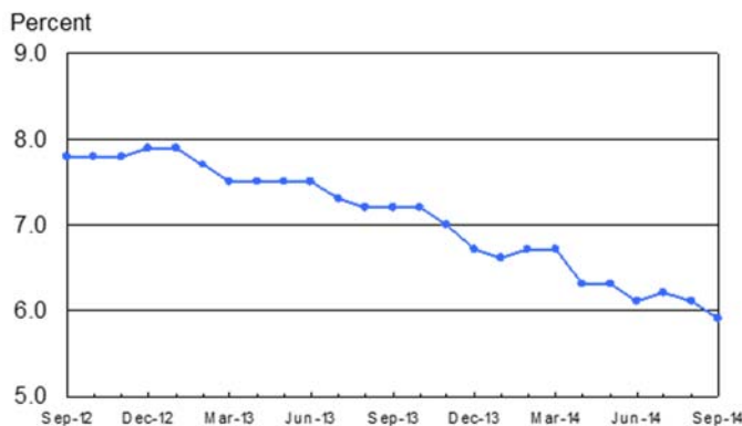
Chart 1. Unemployment rate, seasonally adjusted, September 2012 – September 2014