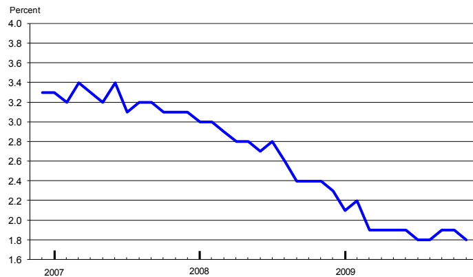
Chart 1. Job openings rate, seasonally adjusted, December 2006 - November 2009