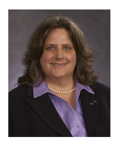
U.S. Bureau of Labor Statistics