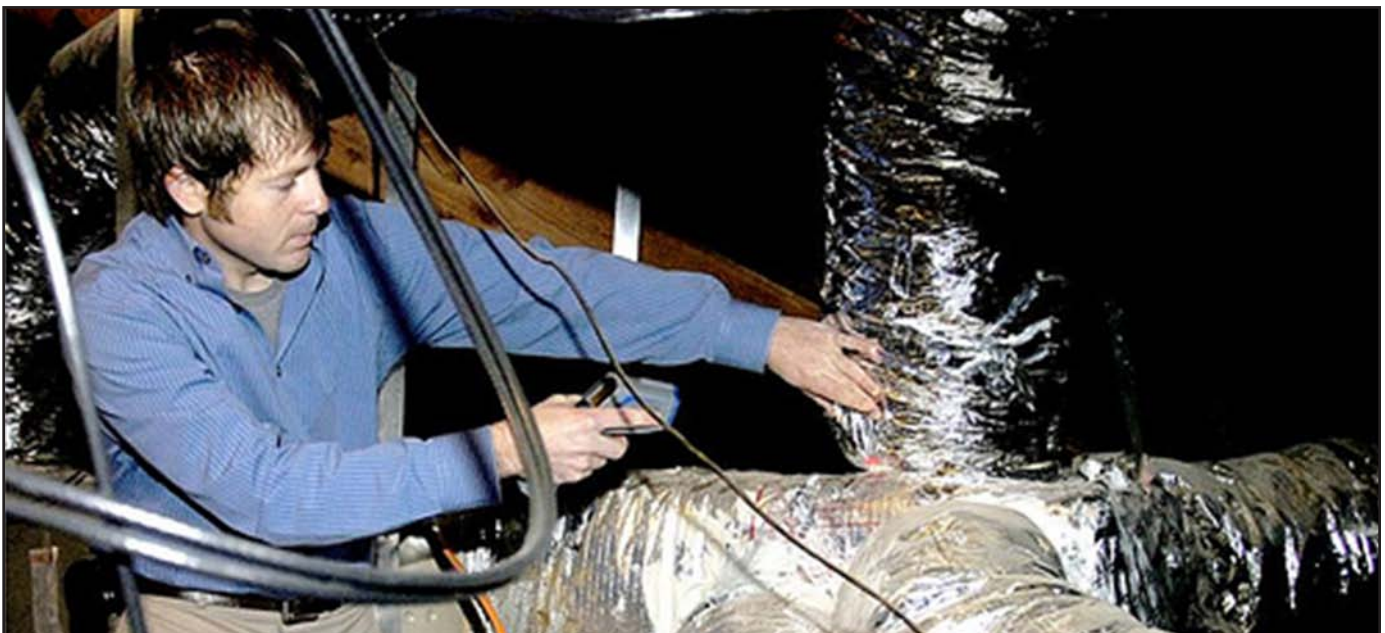
Energy auditor checking insulation around pipes

By increasing a building's energy efficiency, energy auditors can create a cleaner environment and help customers save money. As long as they are able to produce financial savings for their clients, energy auditors should find continued demand for their skills. As more home and building owners recognize the benefits of energy audits, the number of auditors will likely grow. The lack of education and training requirements to become an energy auditor provides an excellent opportunity for workers without a college degree.