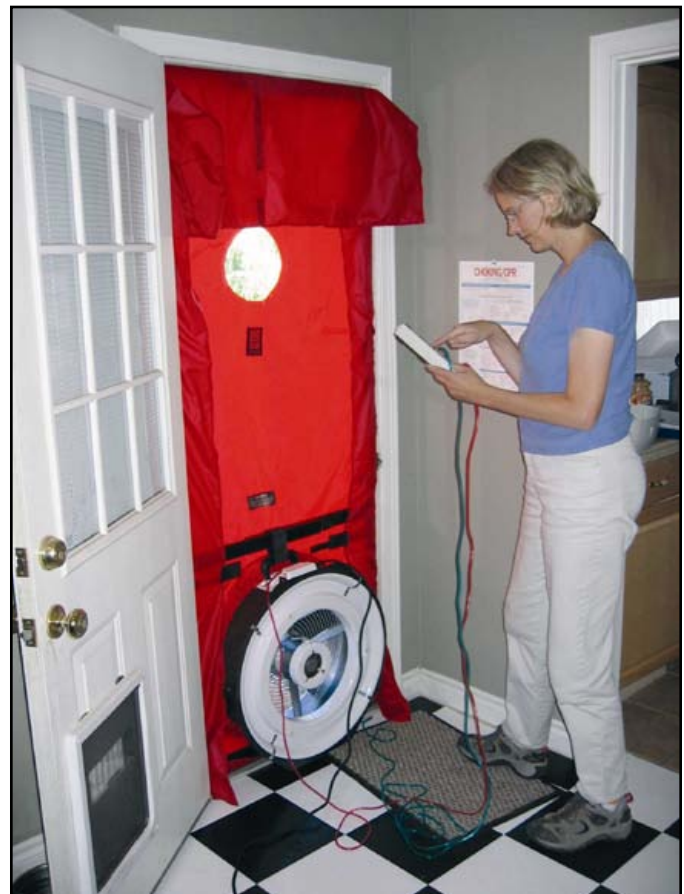
Energy auditor conducting blower-door test

Some energy auditors are knowledgeable about heating and ventilation systems. When conducting inspections, these auditors usually check the heat pump, furnace, air filter, air conditioners, and other building