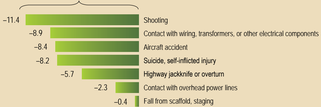
Fewer fatalities in 2004–06 than in 2001–03 (percent)