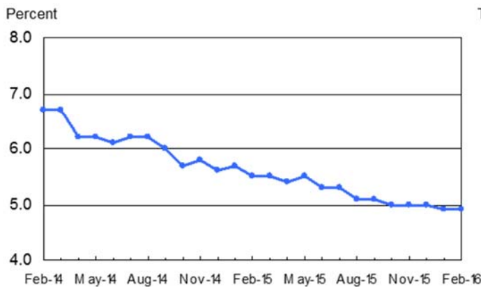
Chart 1. Unemployment rate, seasonally adjusted, February 2014 – February 2016