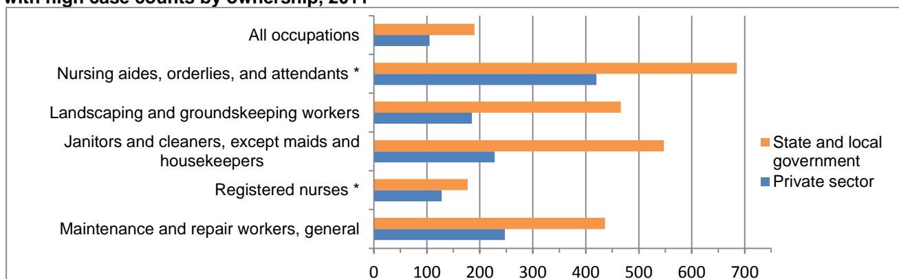
Chart A. Incidence rates of injuries and illnesses with days away from work for selected occupations 1 with high case counts by ownership, 2011

The incidence rate for public sector workers was 190 cases per 10,000 full-time workers (compared to a rate of 105 for private industry). Some occupations experienced higher rates in the public sector (state and local government combined) than their counterparts in the private sector. Janitors and cleaners and landscaping and groundskeeping workers had a public sector rate that was over twice that of the private sector. (See chart A.)