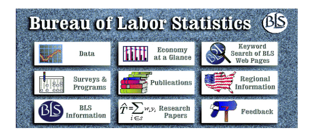
Exhibit 1 – Original BLS Internet homepage, 1995