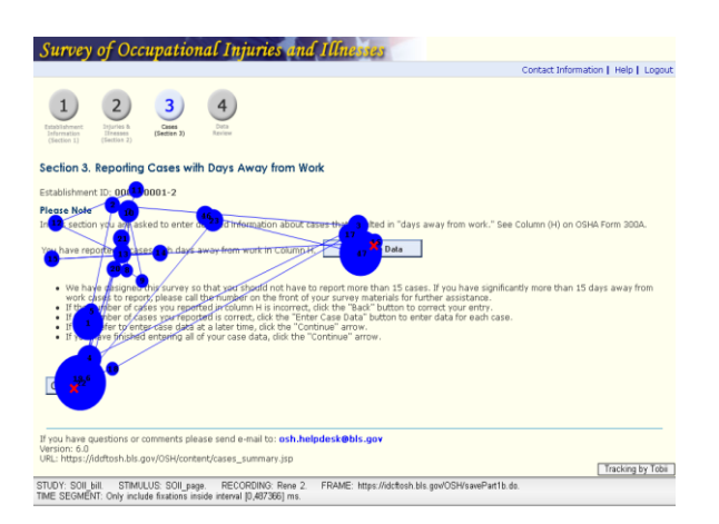
Exhibit 7 – Gaze path showing how individual's eye reviews page from the BLS Internet Data Collection Facility