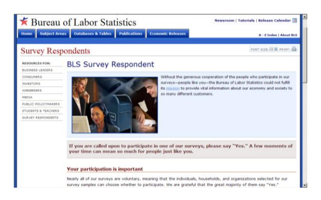
Exhibit 8 – BLS Internet page for survey respondents