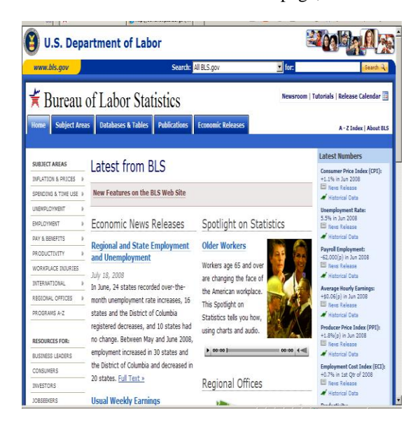
Exhibit 3 – BLS Internet homepage, 2008