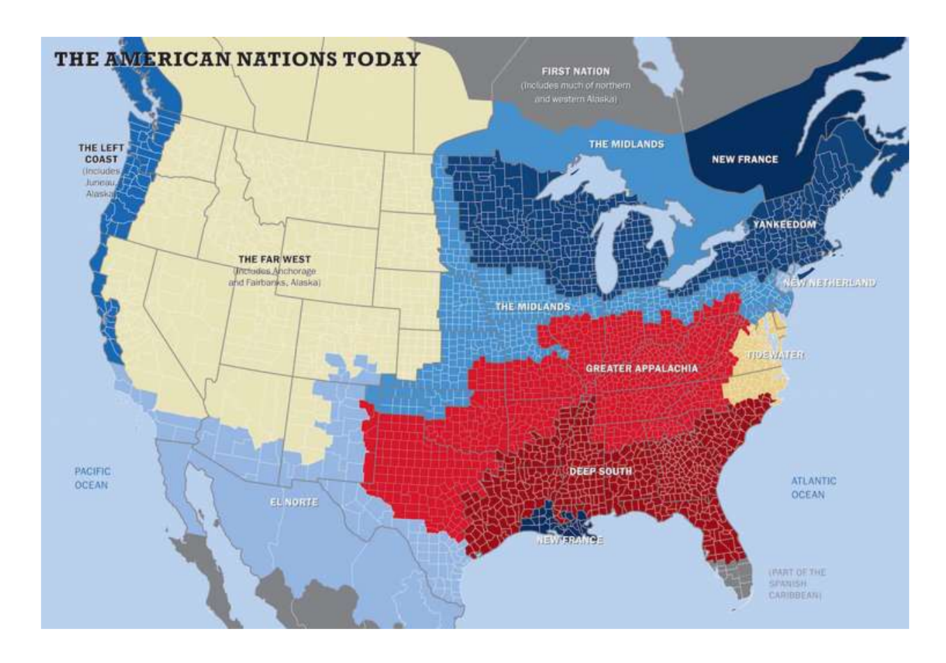
Figure 1: Cultural differences between regions.