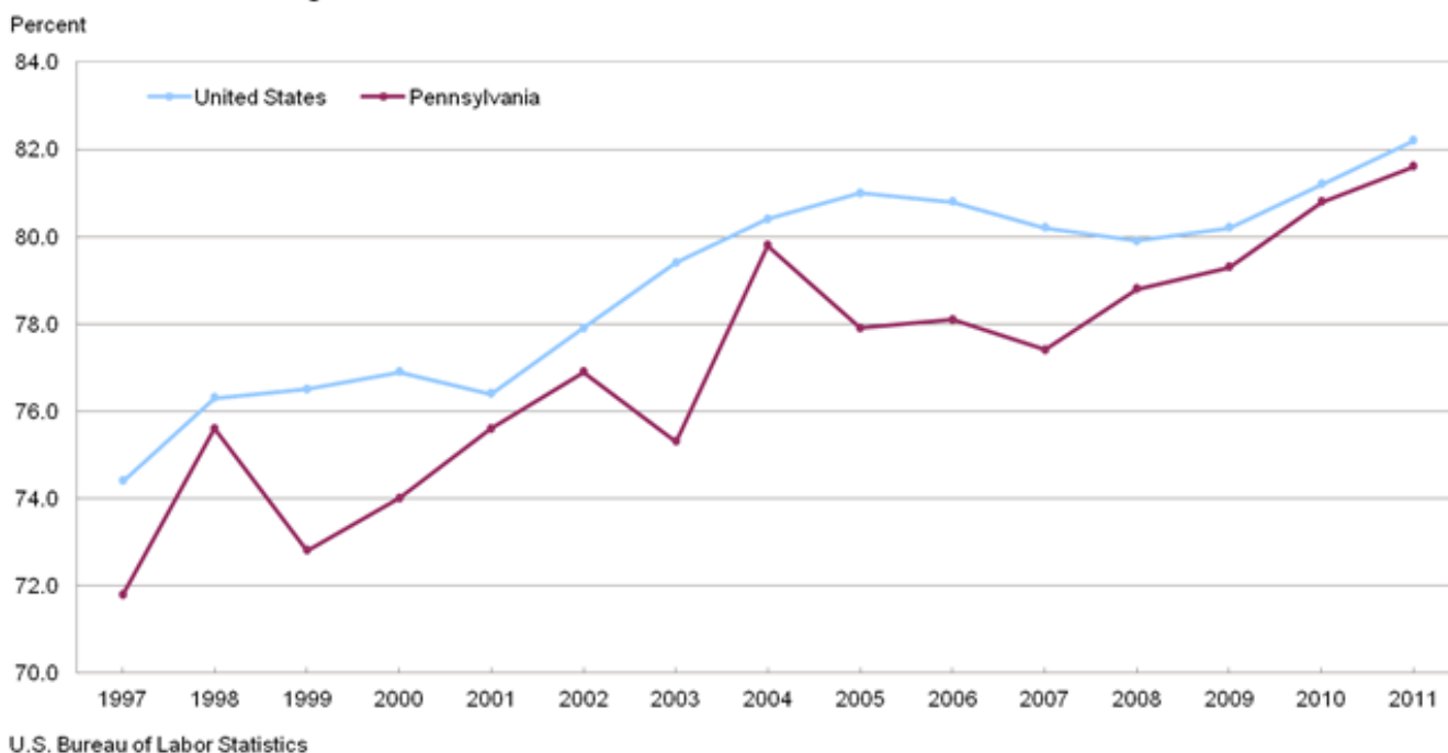
Chart 1. Women's earnings as a percent of men's, full-time wage and salary workers, United States and Pennsylvania, 1997-2011 annual averages

Among the 50 states, median weekly earnings of women in full-time wage and salary positions in 2011 ranged from $564 in Montana to $878 in Connecticut. States with the highest wages for women were located along the Eastern Seaboard. In addition to Connecticut, women's earnings in Massachusetts, New Jersey, and Maryland were also above $800, followed by New York at $760 per week. (See table 1 and chart 2 .)