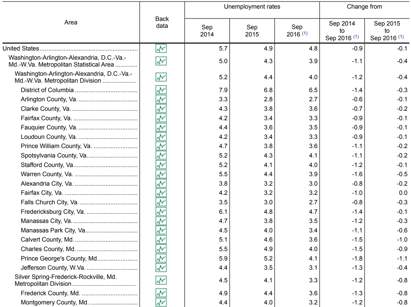
Table A. Unemployment rates for the United States, the Washington-Arlington-Alexandria, D.C.-Va.-Md.-W.Va. Metropolitan Statistical Area, and its components, not seasonally adjusted

(1) Data for the Washington-Arlington-Alexandria, D.C.-Va.-Md.-W.Va. Metropolitan Statistical Area and its components are preliminary for the most recent month.