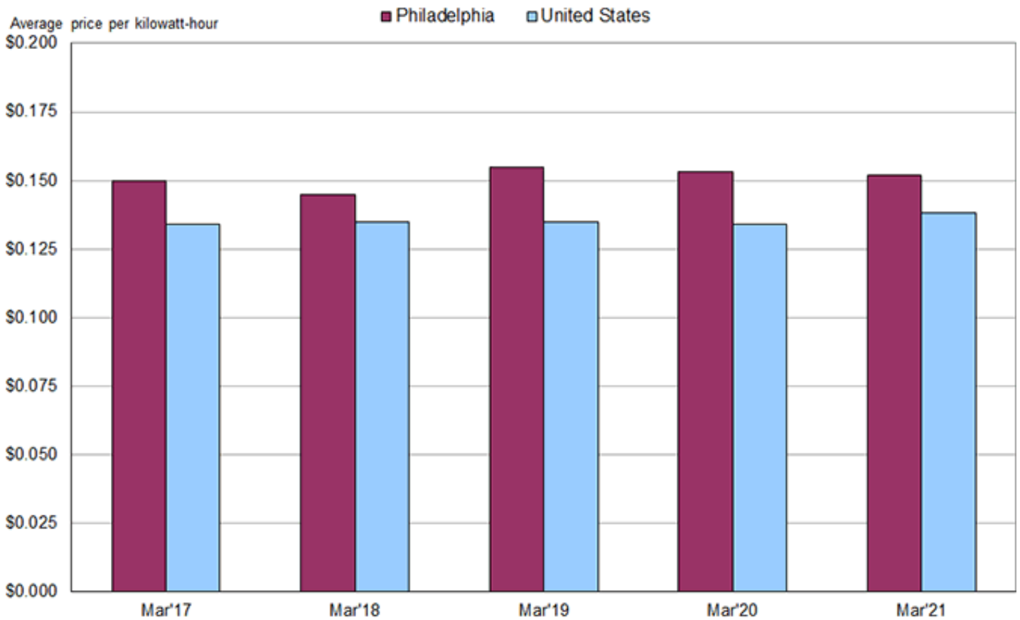
Chart 2. Average prices for electricity, Philadelphia-Camden-Wilmington and United States, March 2017-March 2021