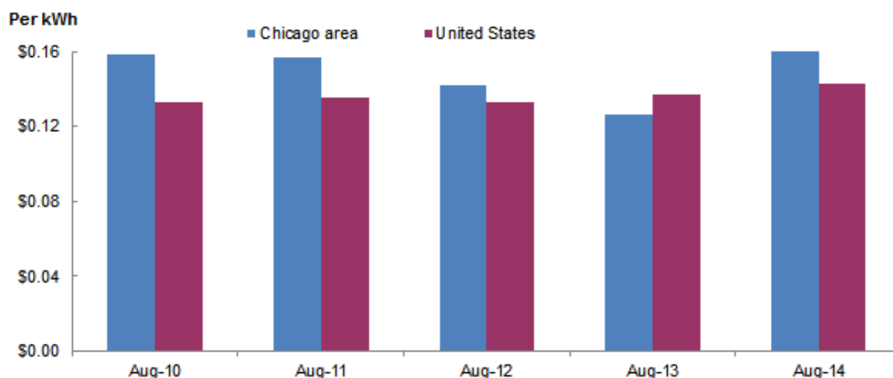
Chart 2. Average prices for electricity, Chicago-Gary-Kenosha and the United States, 2010-2014 (as of August)

SOURCE: U.S. Bureau of Labor Statistics.