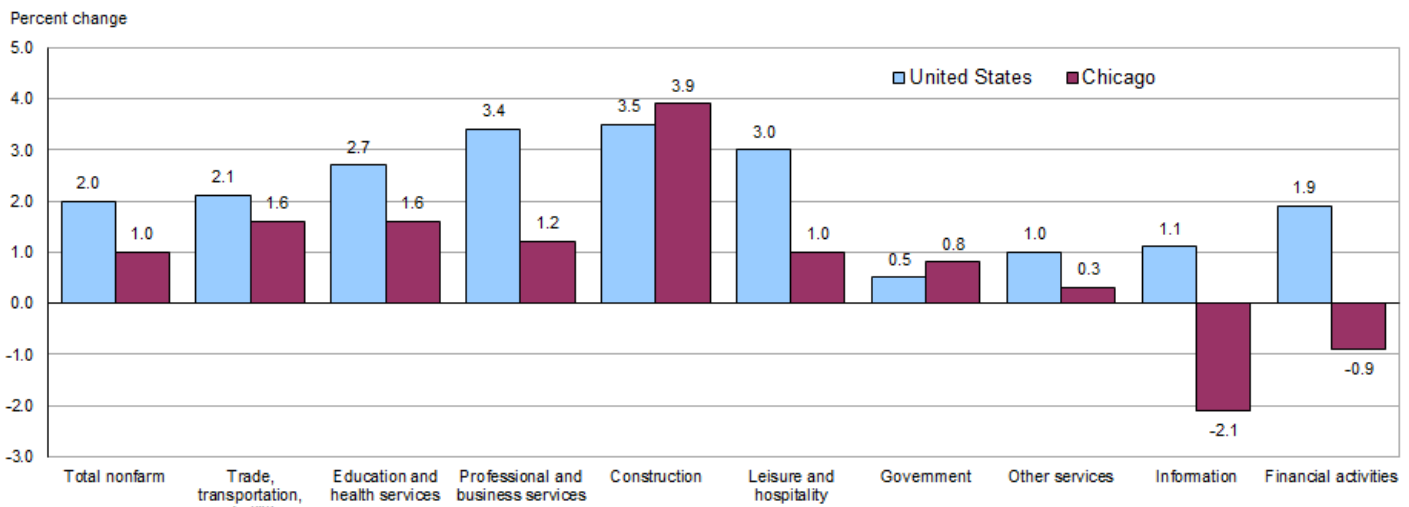
Chart 2. Total nonfarm and selected industry supersector employment, over-the-year percent change, United States and the Chicago metropolitan area, August 2015