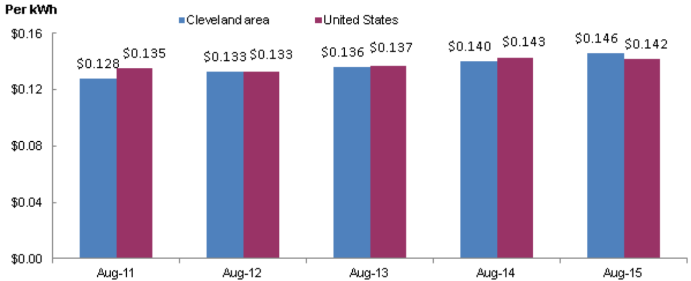
Chart 2. Average prices for electricity, Cleveland-Akron-Lorain and the United States, 2011-2015 (as of August)

Source: U.S. Bureau of Labor Statistics.