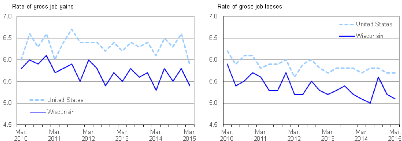
Chart 2. Private sector gross job gains and losses as a percent of employment, United States and Wisconsin, March 2010–March 2015, seasonally adjusted