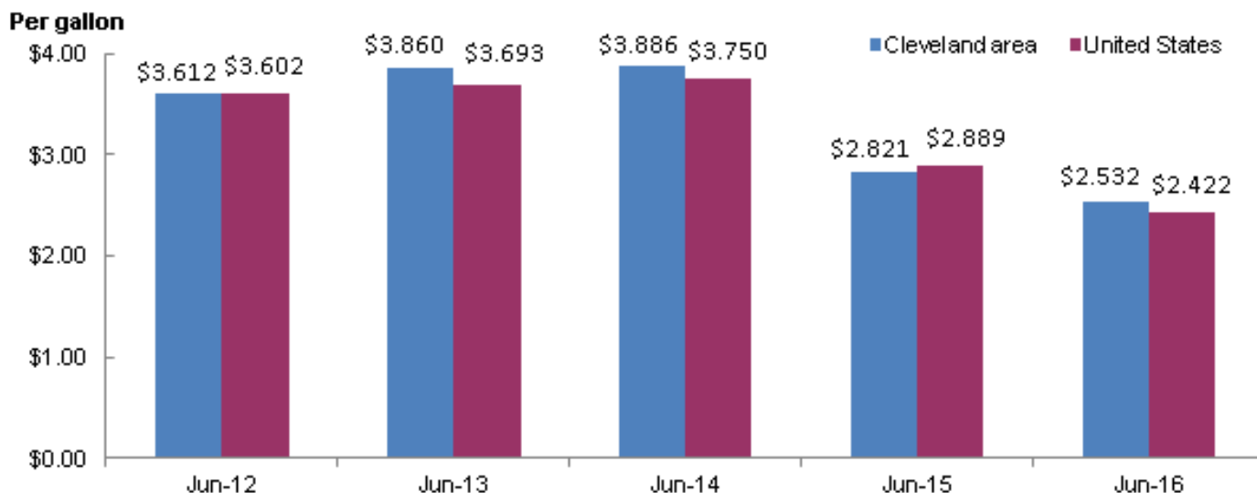
Chart 1. Average prices for gasoline, Cleveland-Akron-Lorain and the United States, 2012-2016 (as of June)

Source: U.S. Bureau of Labor Statistics.