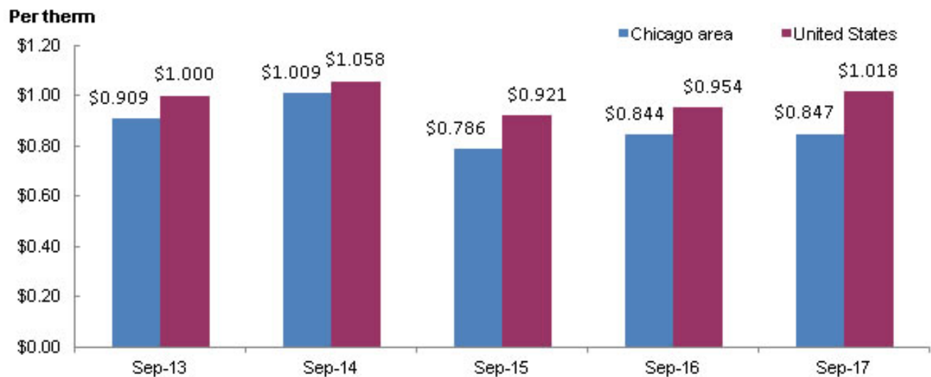
Chart 3. Average prices for utility (piped) gas, Chicago-Gary-Kenosha and the United States, 2013-2017 (as of September)

Source: U.S. Bureau of Labor Statistics.