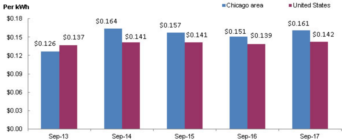
Chart 2. Average prices for electricity, Chicago-Gary-Kenosha and the United States, 2013-2017 (as of September)

Source: U.S. Bureau of Labor Statistics.