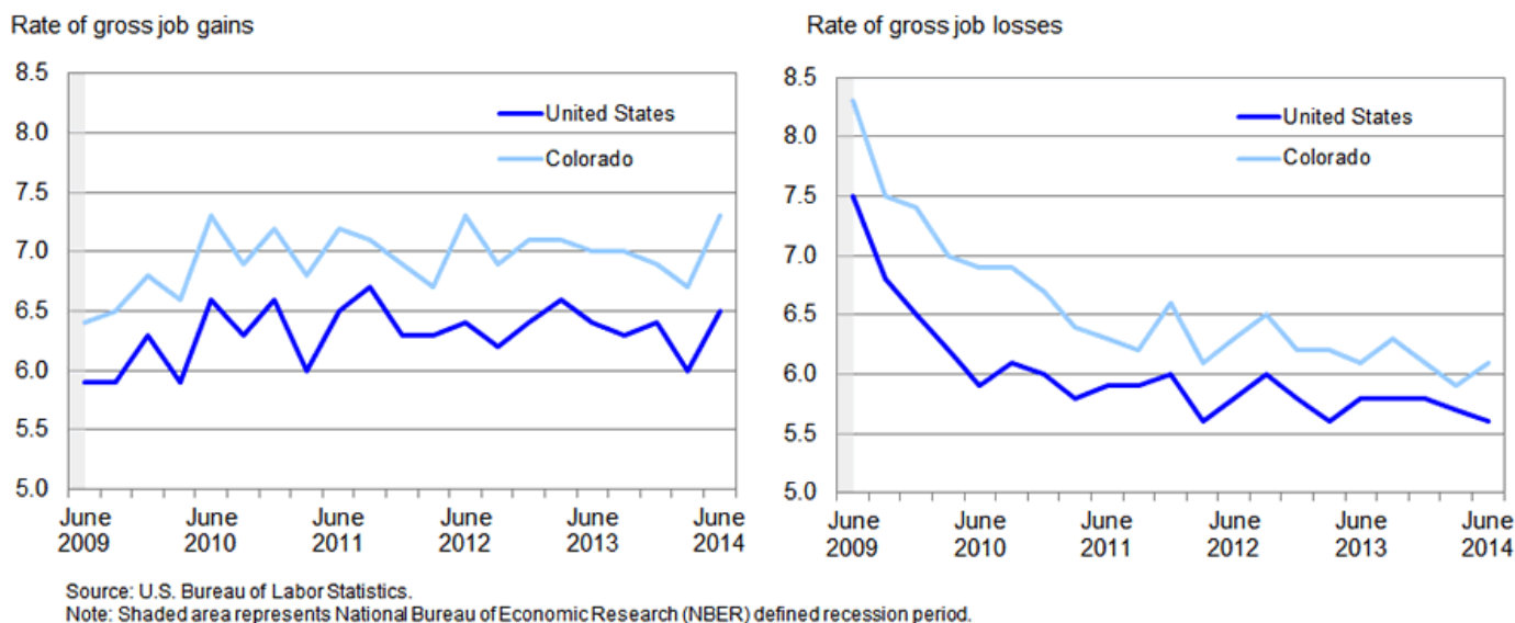
Chart 2. Private sector gross job gains and losses as a percent of employment, United States and Colorado, June 2009–June 2014, seasonally adjusted

Gross job gains represented 7.3 percent of private sector employment in Colorado in the quarter ended June 2014, while nationally gross job gains accounted for 6.5 percent of private employment. (See chart 2 .) The rates of both gross job gains and gross job losses in Colorado have been above the U.S. rate since data were first published in 1992.