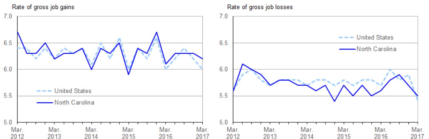
Chart 2. Private sector gross job gains and losses as a percent of employment, United States and North Carolina, March 2012–March 2017, seasonally adjusted