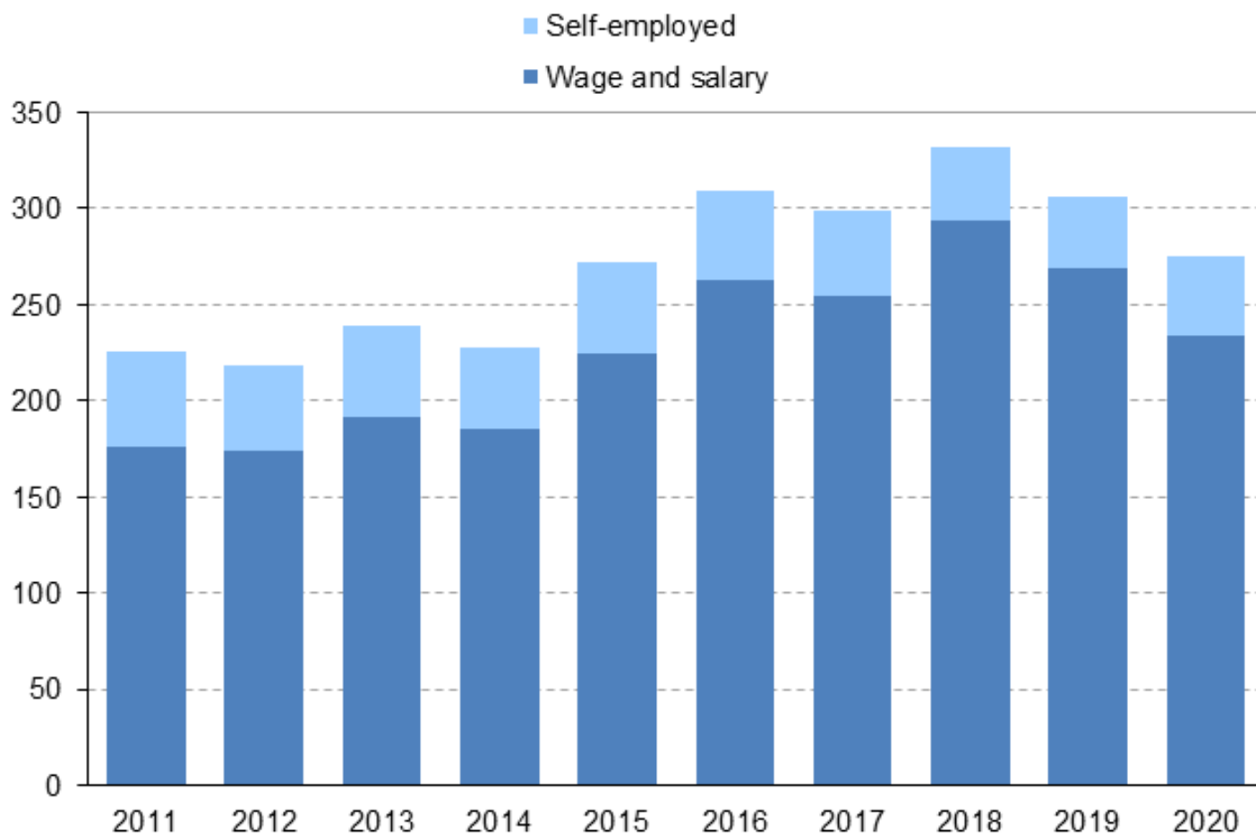
Chart 1. Number of fatal occupational injuries by employee status, Florida, 2011–20