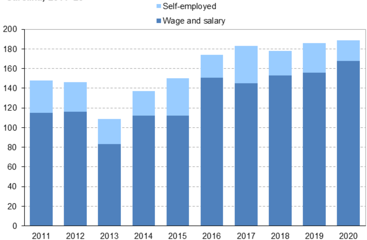
Chart 1. Number of fatal occupational injuries by employee status, North Carolina, 2011–20