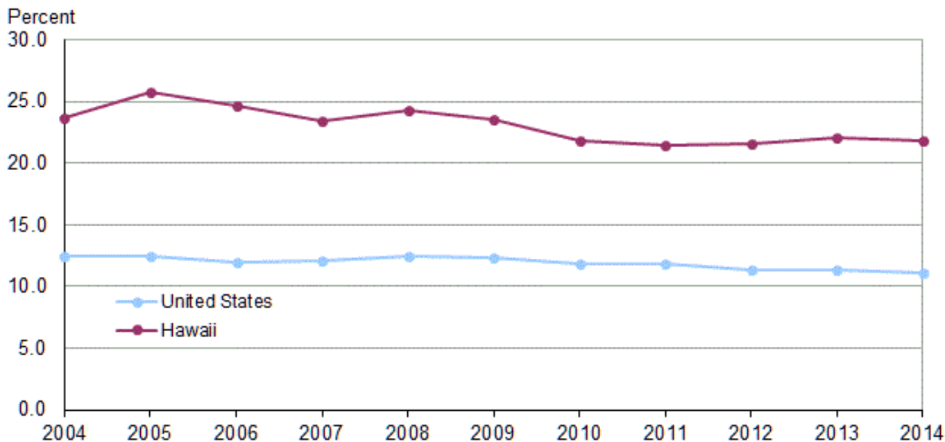
Chart 1. Members of unions as a percent of employed in the United States and Hawaii, 2004-2014

Source: U.S. Bureau of Labor Statistics.