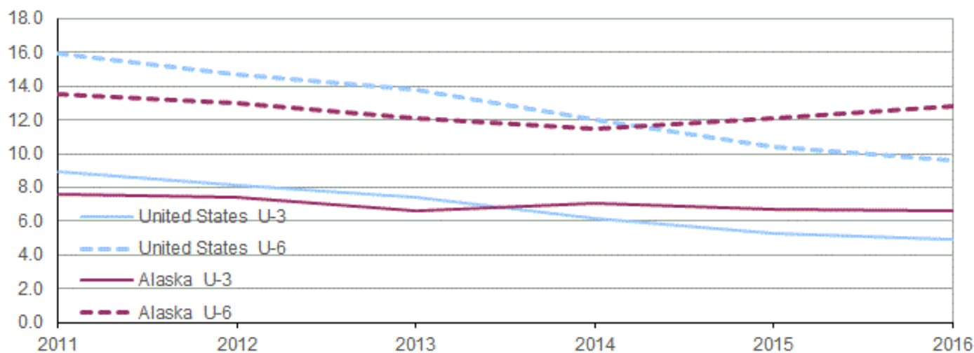
Chart 1. Two alternative measures of labor underutilization, United States and Alaska, 2011–16 annual averages